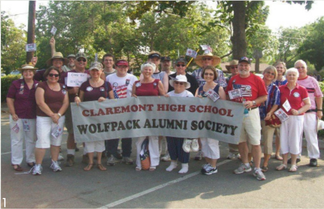
1 This is a group picture of the Alumni Association at the 4th of July Celebration near Memorial Park. Representing all alumni, the group walked through the parade decked out in patriotic clothing and gear.